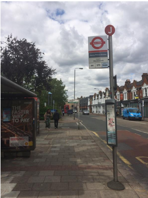
Figure 2B: Swaffield Road stop