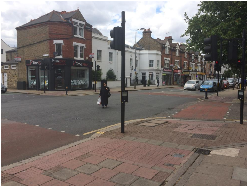
Figure 2A: the junction of Kimber Road, Swaffield Road and Garratt Lane

Despite having no immediate access via pedestrian crossing, the site has a good level of accessibility for pedestrians. There are dropped kerbs at crossing points to aid those with mobility issues, but there is no tactile information provided, which may limit accessibility for those with sensory impairments. There is a major signalised crossing about 200m to the north, where Kimber Road and Swaffield Road meet Garratt Lane. This is depicted in Figure 2A.