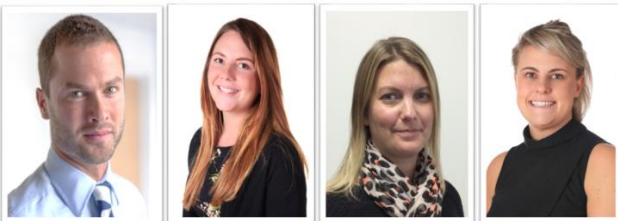
DESIGNATED SAFEGUARDING LEAD: