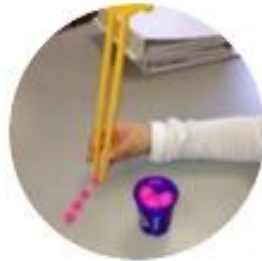
Use tongs/tweezers to pick up blocks/small objects