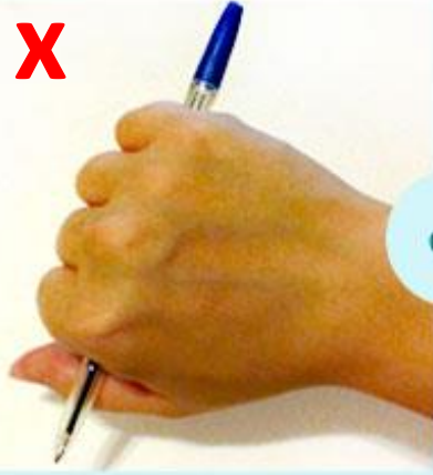
DIGITAL PRONATE GRIP

All fingers are holding the writing tool but the wrist is turned so that the palm is facing down towards the page. Movement now comes mostly from the elbow. Children should start being able to copy a horizontal, vertical and circular line.