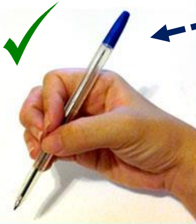
STATIC TRIPOD GRIP

Nursery & Reception This is a 3 finger grasp, where the thumb, index finger and middle finger work as one unit.