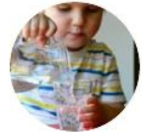
Pouring from small pitcher to specific level in clear glass