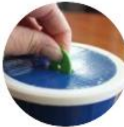
Putting coins into piggy banks