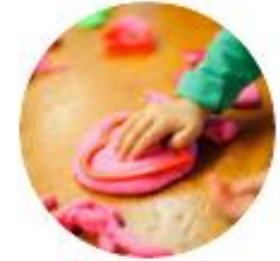
Play dough or silly putty