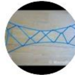
Finger plays/string games