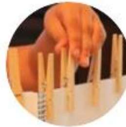
Clothes pegs pinching