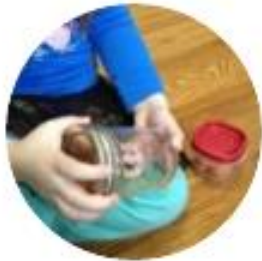
Practice screw and unscrew lids