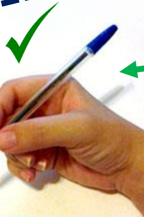
DYNAMIC TRIPOD GRIP

Nursery & Reception This is a 3 finger grasp, where the thumb, index finger and middle finger work as one unit.