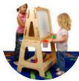
Writing on easels or vertical surface