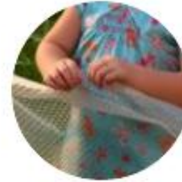
Popping bubble wrap